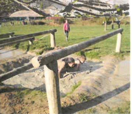
Camp Adair Memories Room 4